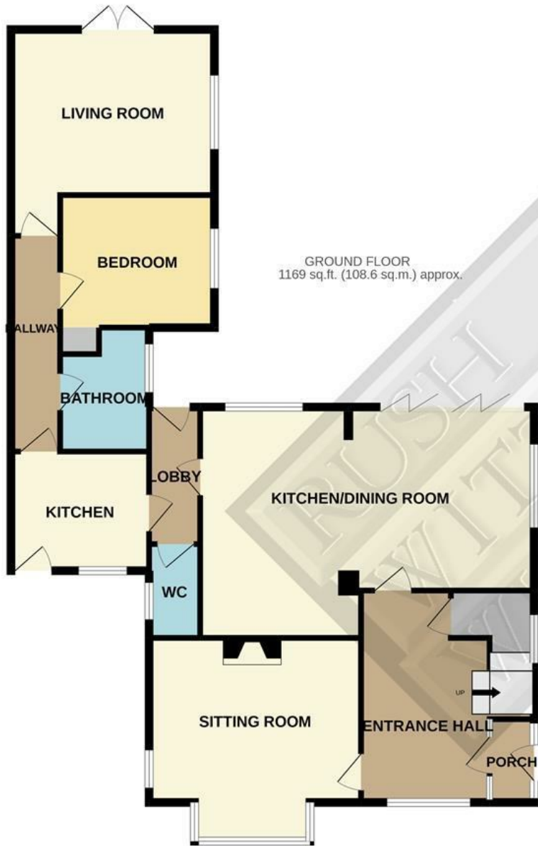
GROUND FLOOR 1169 sq.ft. (108.6 sq.m.) approx.