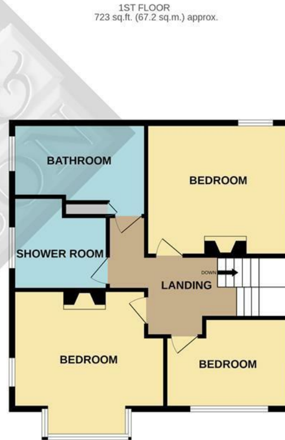
1ST FLOOR 723 sq.ft. (67.2 sq.m.) approx.

TOTAL FLOOR AREA : 1892 sq.ft. (175.7 sq.m.) approx.